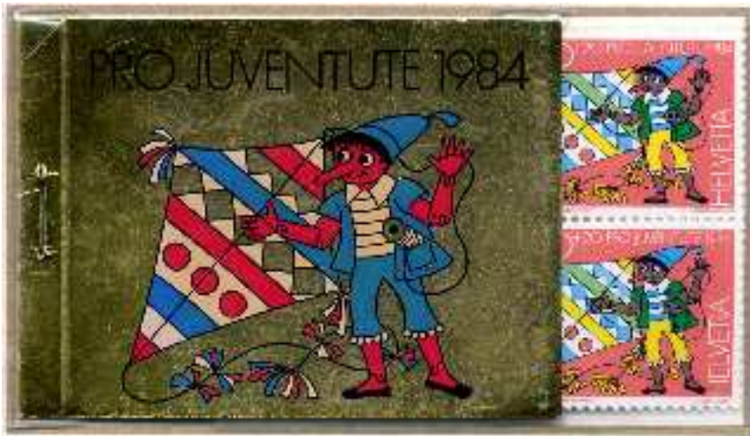
Complete Pinocchio booklet. The stamps support Swiss children and adolescents through the Pro Juventute Foundation.

In order to explode the Pinocchio booklet, having removed the staple, carefully remove one sheet. Re-assemble booklet and mount booklet on page with corner photo mounts. These would go on the left hand side and the bottom of the back page on the right.