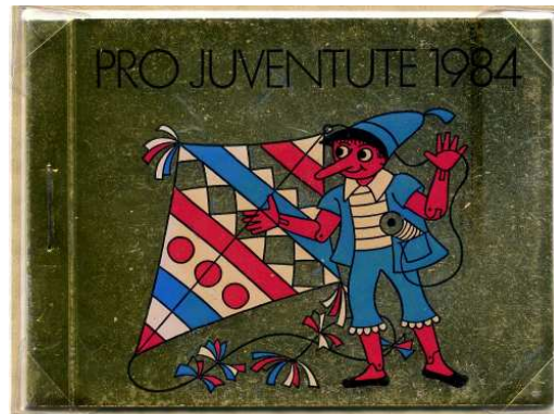
Complete Pinocchio booklet. The stamps support Swiss children and adolescents through the Pro Juventute Foundation.

Complete booklet. Stamps are photo copies. The stamps should be shown