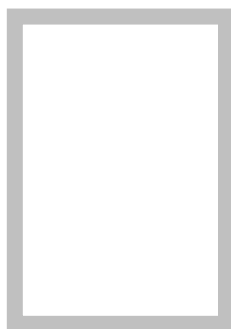
Shift high and right