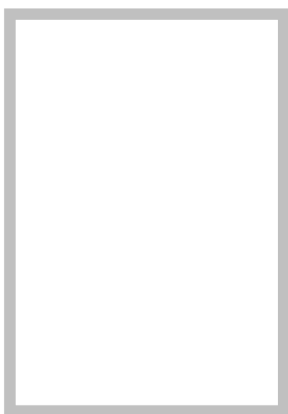
High vertical shift

It was obviously very difficult to maintain registration during the overprinting process and various shifts can be found.